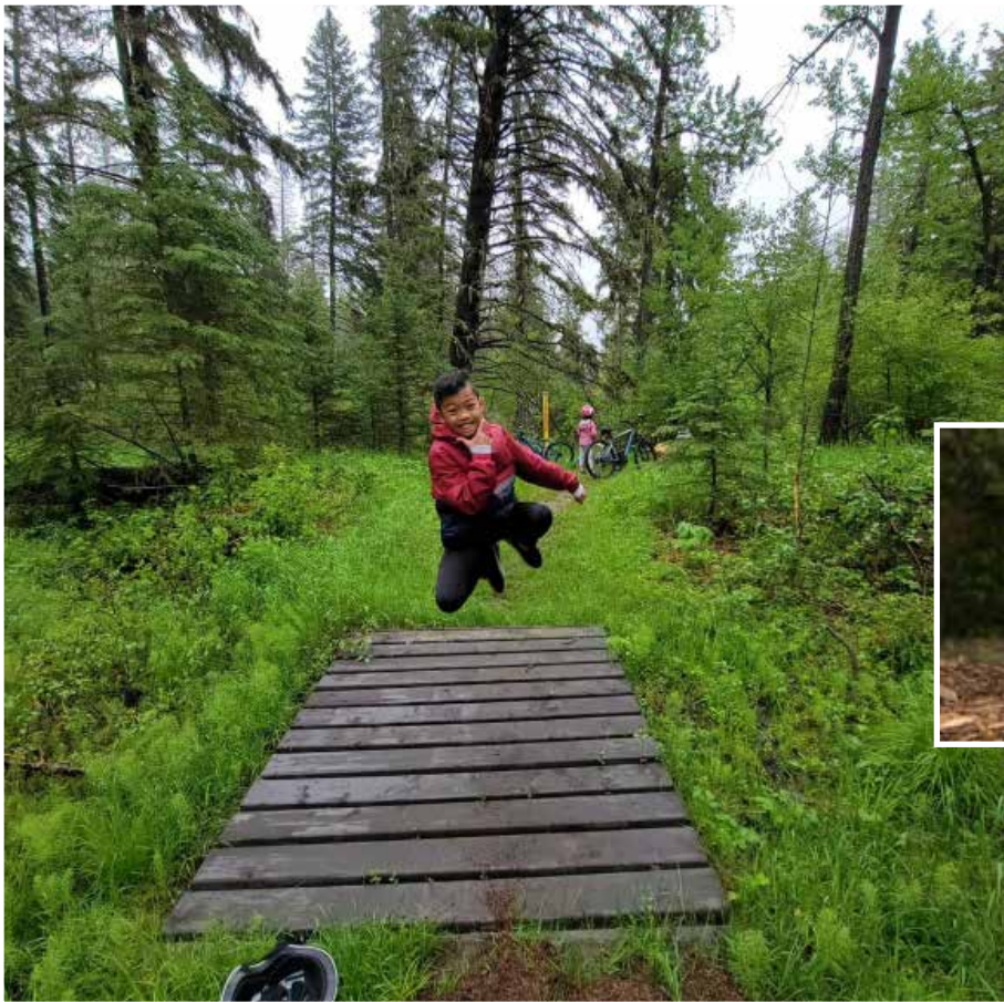
Early Bird winning photo