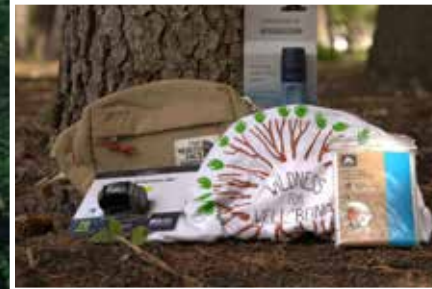
Honorable mention winning photos