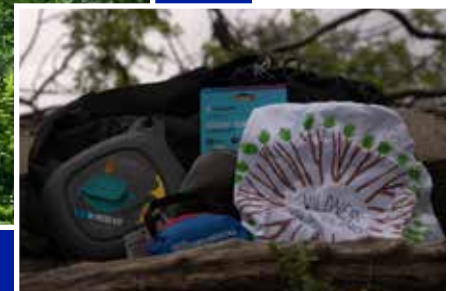
The winning photograph, captured at Peegee Man Trail near North Battleford

The winners in the Give Us Your Best Shot Photo Contest included: