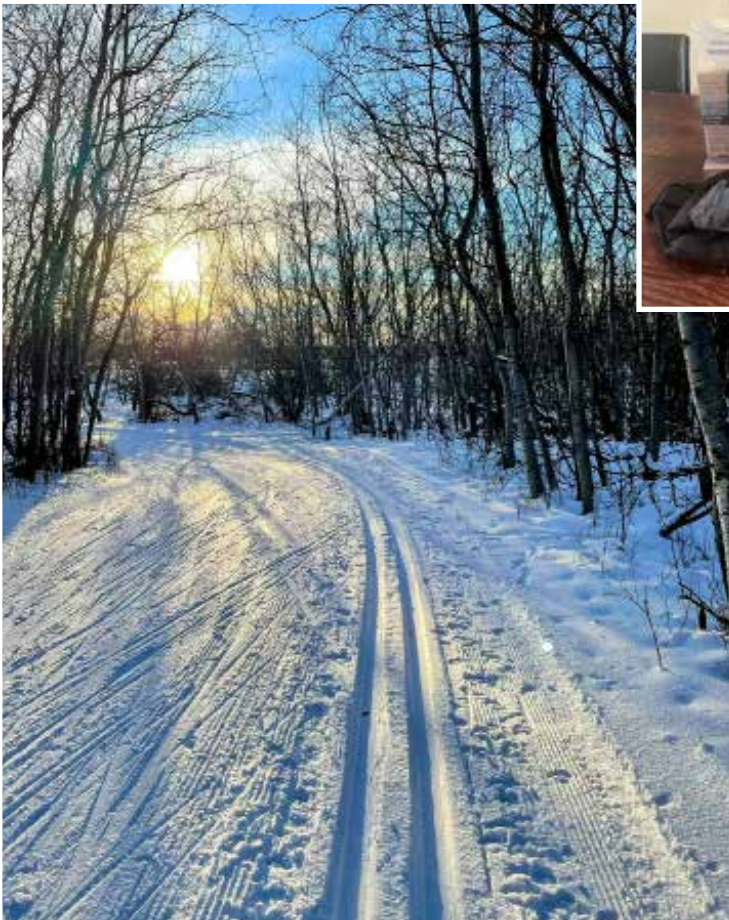
Honorable mention winning photo